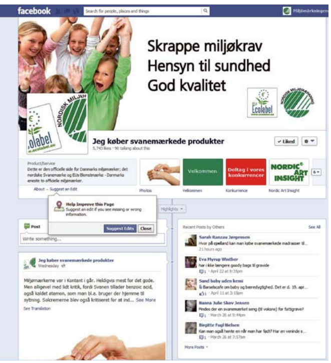
The Danish Facebook page communicates a single day with up to 150 persons.

Danish surveys have shown that our fans have a great knowledge of the Nordic Ecolabel and are women, aged 25 to 35 and living with small children – the younger the children the more eager the mothers are who visit our Danish Facebook page. They are concerned about the environment and climate change,