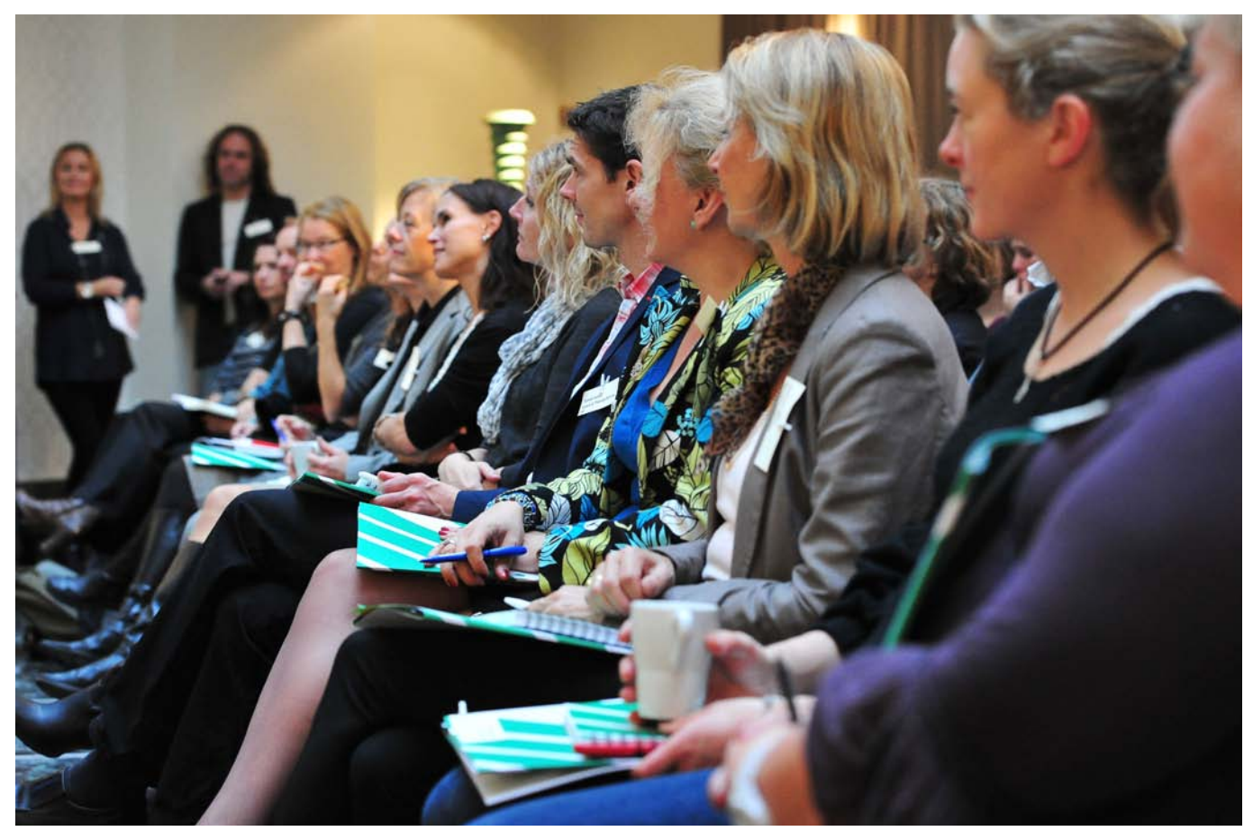
Intrigued visitors at Nordic Ecoabelling's network seminar, Stockholm.