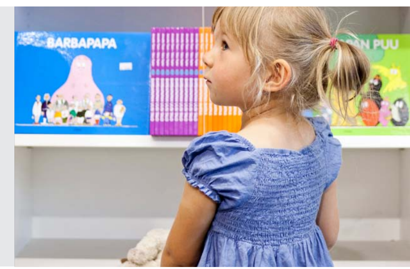
The Finnish publishing company Otava decided in 2012 that all their books shall be Nordic Ecolabelled in the future.

Source: Yougov – Nordic Consumer Survey 2013 – Total conducted interviews: 4670