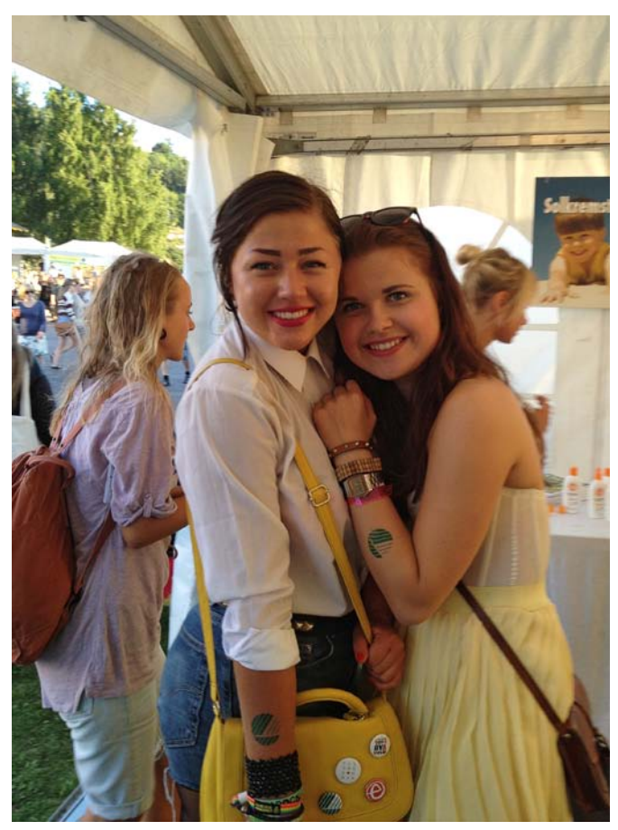
Happy tattooed visitors at the Øyafestival.

Although there is an awareness of how harmful it is, both to your own health and to the environment, to wash your car on your driveway, people still do it. Last year, Nordic Ecolabelling in Sweden started a campaign to stop people from doing this and to persuade more carwash owners to apply for the Nordic Ecolabel. The result of the campaign was a doubling of Nordic Ecolabelled carwashes and many newsarticles as well as many tweets and mentions on blogs and on Facebook.